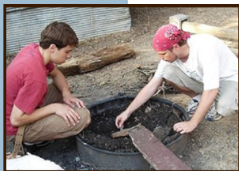
Youth at St. B's learn by doing.